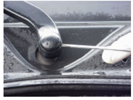
Step 2: Remove Windshield Wipers.

Remove Windshield Wipers to ease removal and installation of ECM.